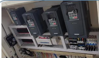
Electric Control Cabinet