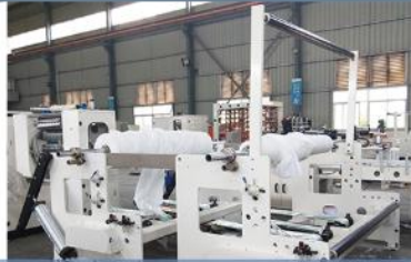
Jumbo Roll Standing