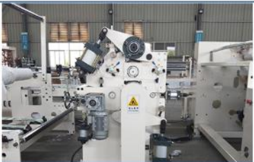
Glue Lamination Part