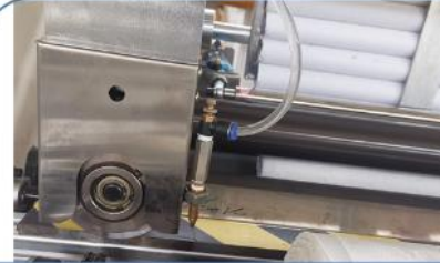
Tail Gluing Device